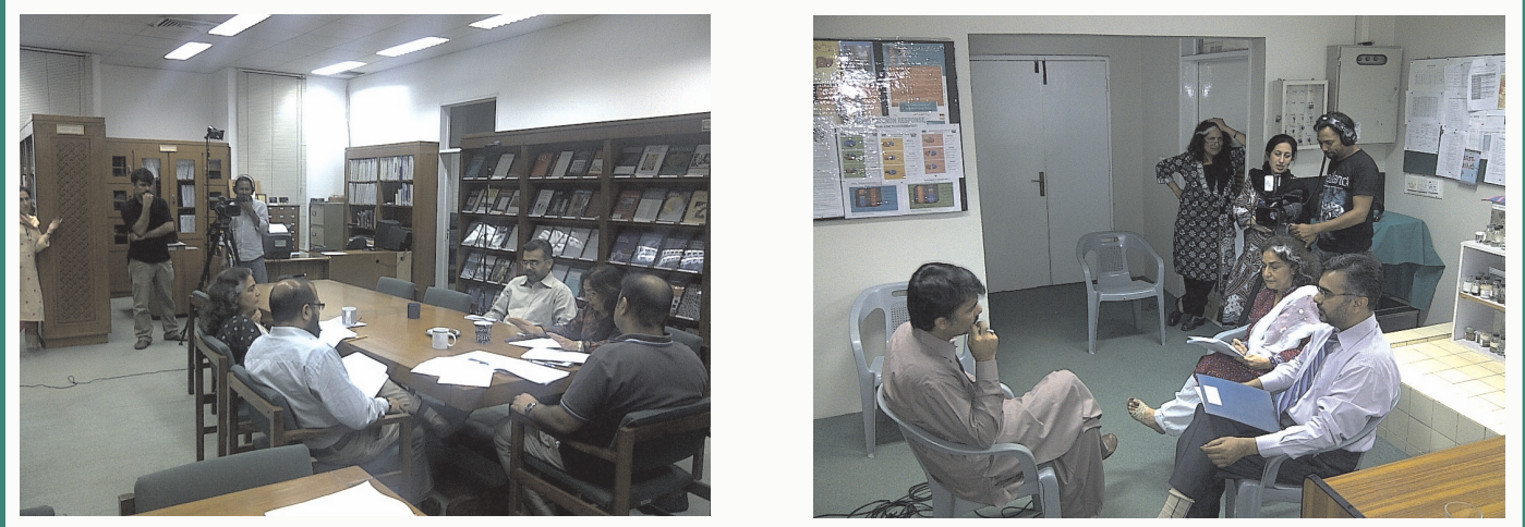
Shooting in progress for the video "More than meets the eye." On the left, a scene filmed in the SIUT library (at 11.00 pm) depicts a group of healthcare professionals discussing the case of a quadriplegic child. The picture on the right, shot in a hospital seminar room, pictures a surgeon and a psychologist speaking with the patient's brother.